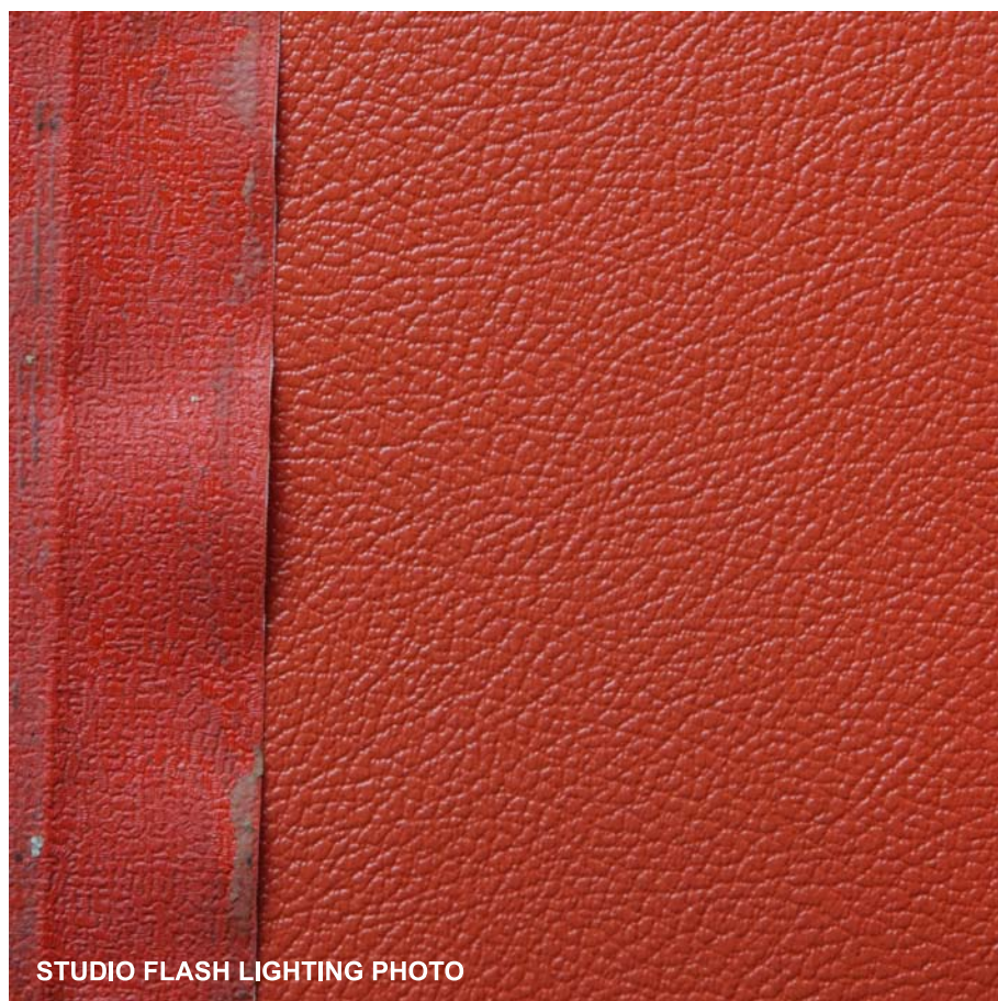
STUDIO FLASH LIGHTING PHOTO

Comparison of replica vinyl with faded and stained outside of UK Vox Continental II lid