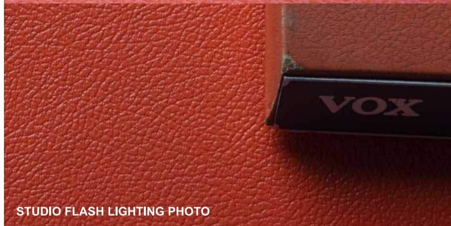
STUDIO FLASH LIGHTING PHOTO

Comparison of replica vinyl with faded and stained outside of UK Vox Continental II lid